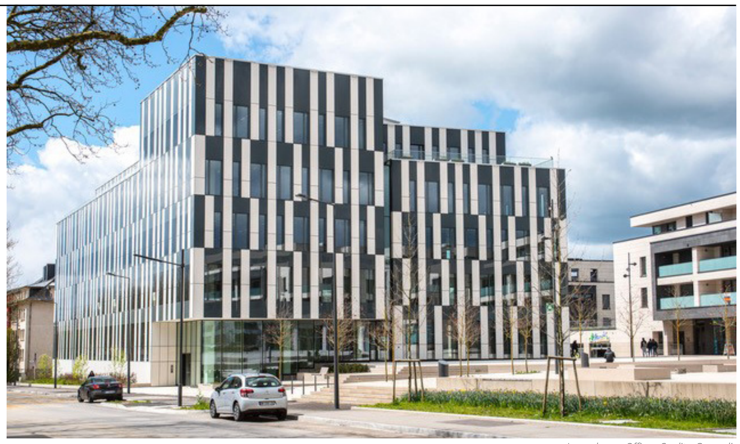
Luxembourg Office

This sits well with the current trend amongst global companies towards decentralisation. In other words, decisions on benefits are increasingly being left to local subsidiaries who benefit from the cost efficiencies and clout – when it comes to negotiations – afforded by the parent company, the latter of which also handles functions such as governance and compliance on behalf of the whole group.