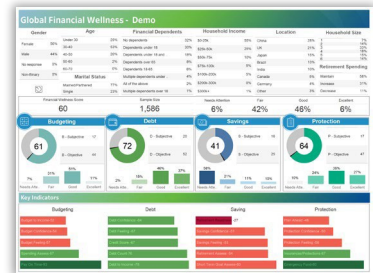
Screenshots for illustrative purposes only